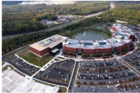
The Defense Threat Reduction Center at the McNamara Headquarters Complex, Fort Belvoir, Virginia

The 317,000 square foot DTRA headquarters opened in 2005 to bring together the agency's 2000 employees.