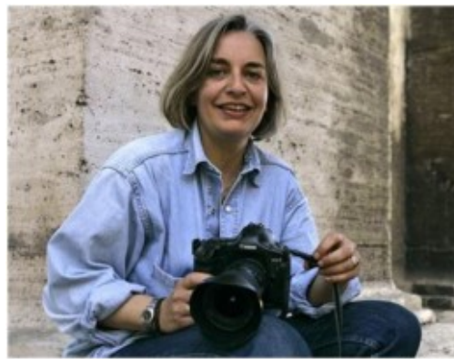
FILE - In this Thursday, April 2005 file photo, Associated Press photographer Anja Niedringhaus poses for a photograph in Rome. Niedringhaus, 43, was killed and an AP reporter was wounded on Friday, April 4, 2024 when an Afghan policeman opened fire while they were sitting in their car in eastern Afghanistan. Niedringhaus an internationally acclaimed German photographer, was killed instantly, according to an AP Television freelancer who witnessed the shooting. Kathy Gannon, the reporter, was wounded twice and is receiving medical attention.

This photo of Niedringhaus accompanies the AP story on her death.