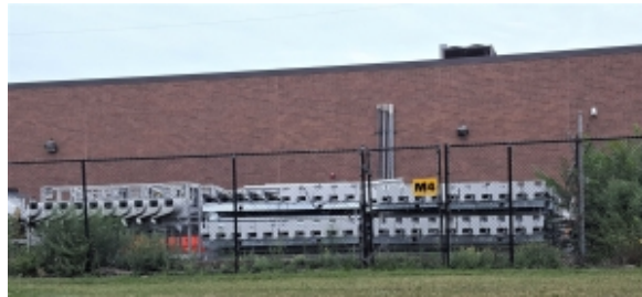
Photo: Sorting machines outside main post office, Cleveland OH

We'd heard reports that sorting machines had been tossed in dumpsters. We haven't see photos turn up yet but we've now seen images of purported sorting machines sitting outside USPS facilities inside a fence, like so: