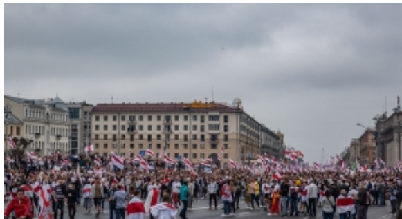
August 23rd protest in Minsk

After enduring decades years of post-Soviet strong man rule, they are joining the Green Revolution, OWS, the Umbrella Revolution, Euromaidan, the Ethiopian protests, The Puerto Rican anticorruption protests, The Chilean Spring, and the on and on of the last years (and years to come) in saying No More of This Nonsense. What ties the Belarusian protests to all these others is how tired people are of systems that just don't work for anyone but those at the very top. And they can see the petulant normality of those people at the top now, more than ever in human history, they can see how hollow and ridiculous it all is.