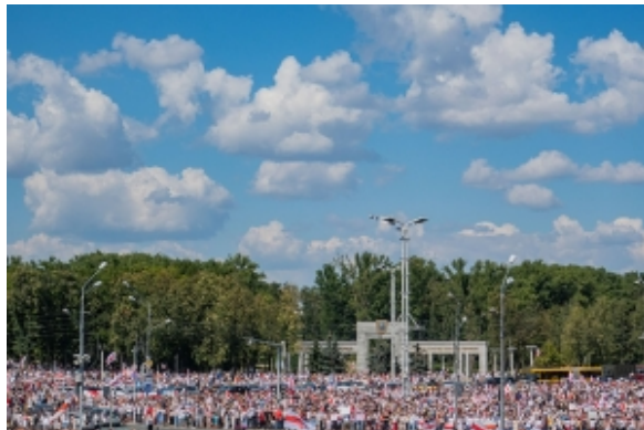
August 16th protests in Minsk

The revolutions continue. Right now, the eastern European country of Belarus is weeks into street protests and strikes against the long and corrupt rule of Alexander Lukashenka, the main ruler Belarus has seen in the post-Soviet era, after he defeated Vyacheslav Kebich in 1994 and started a power consolidation right up to 2020, and perhaps no further. He rigged the election in early August, but Belarus is having nothing of it.