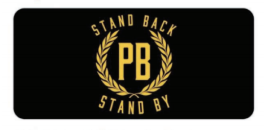
11:38 AM \cdot Nov 7, 2020 from San Francisco, CA \cdot Twitter for iPhone