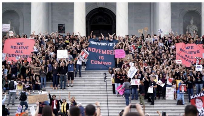
— Protesters against U.S. Supreme Court nominee Brett Kavanaugh demonstrate at the East Front of the U.S. Capitol in Washington on Oct. 6, 2018.

It’s not. While there were protestors that day at the Supreme Court, and while the story Nordean mistitles and doesn’t include a URL for does describe protestors storming past a police line on the Supreme Court stairs , the picture Nordean used was, indeed, from the Capitol steps.