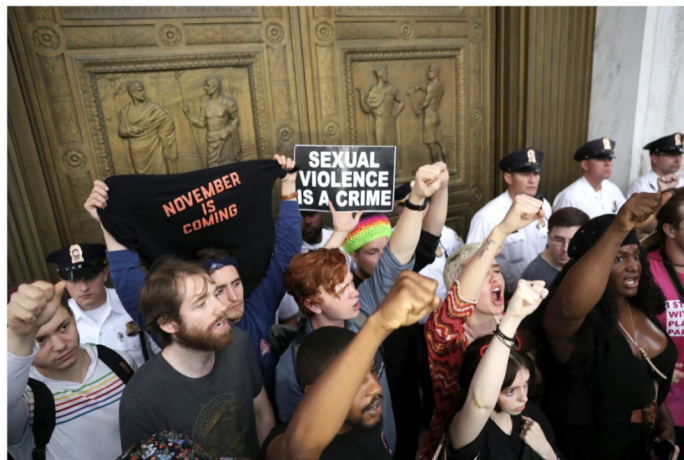
— Protesters storm the steps and doors of the U.S. Supreme Court building as Judge Brett Kavanaugh is sworn in as an Associate Justice of the court inside on Capitol Hill in Washington on Oct. 6, 2018.

Here's what the protest at the Supreme Court looked like (again, from the same NBC article), with the caption that makes this incidence of "storming" seem quaint by comparison: