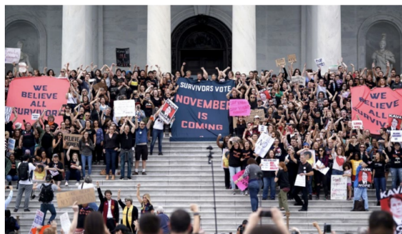
NBC News, Oct. 6, 2018 (VP Pence presiding in Capitol Building)