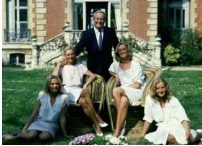
Marine Le Pen at home with family, where she's staying whether she likes it or not.

Right now the right is still nominally lead by Marine Le Pen, despite the fact that she's currently a convicted felon who can't hold office for years to come. Le Pen is in politics for the good of Le Pen, and she would tear her whole party down if it was standing in the wrong place. She's unlikely to use her resources to promote someone else to be the vanguard of the Right and take her place as the RN's presidential candidate. There's always her meat puppet, Jordan Bardella, but he is too afraid of girls to realistically run for the presidency.