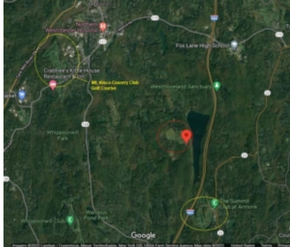
Mt. Kisco Country Club at upper left; the Summit at Armonk at lower right; Seven Springs in center to left of Byram Lake Reservoir.

This is Seven Springs as it appears on Google Maps in satellite view. It is located almost half way between two golf courses – the Mt. Kisco Country Club (opened in 1928) and the Summit at Armonk (opened in 1961).