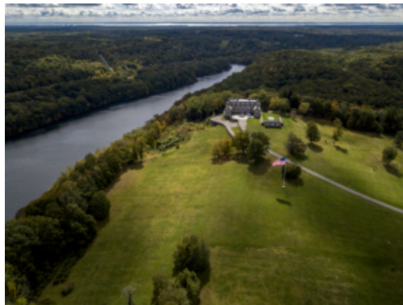
MOUNT KISCO, NY – SEPTEMBER 30 2020: President Trump's Seven Springs estate in Mount Kisco, New York, seen here Sept. 30, 2020.

The part which couldn't be developed because of the lack of local approvals and the road he couldn't add?