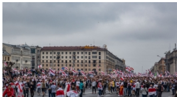
August 23rd protest in Minsk

After enduring decades years of post-Soviet strong man rule, they are joining the Green Revolution, OWS, the Umbrella Revolution, Euromaidan, the Ethiopian protests, The Puerto Rican anticorruption protests, The Chilean Spring, and the on and on of the last years (and years to come) in saying No More of This Nonsense. What ties the Belarusian protests to all these others is how tired people are of systems that just don't work for anyone but those at the very top. And they can see the petulant normality of those people at the top now, more than ever in human history, they can see how hollow and ridiculous it all is.