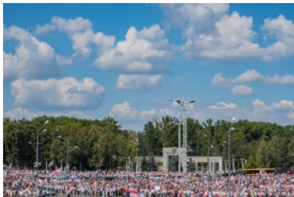
August 16th protests in Minsk

The revolutions continue. Right now, the eastern European country of Belarus is weeks into street protests and strikes against the long and corrupt rule of Alexander Lukashenka, the main ruler Belarus has seen in the post-Soviet era, after he defeated Vyacheslav Kebich in 1994 and started a power consolidation right up to 2020, and perhaps no further. He rigged the election in early August, but Belarus is having nothing of it.