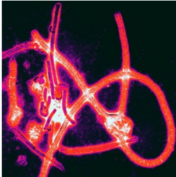
Scary, color-enhanced electron micrograph of Ebola virus particles.

The Ebola outbreak in 2014 led to widespread fear in the US, especially when it was announced that medical personnel who had been treating Ebola patients in Africa and became infected would be transported to Atlanta for treatment. There was no appreciation for how the disease actually is spread, what the conditions were where the medical workers became infected in Africa and how such spread would be much less likely in a properly run US hospital. A poorly run hospital in Texas, however, did manage to have personnel treating Ebola acquire infections. Of course, the treatment at CDC in Atlanta was carried out without incident, and the virus did not spread in the US, even after the Texas hospital had its initial failure. In fact, as the virus wound down, those who study and understand the virus were shown to have been completely correct in their analysis when they modeled how large the outbreak would get before receding once proper intervention was carried out. But the fears of Ebola wiping out