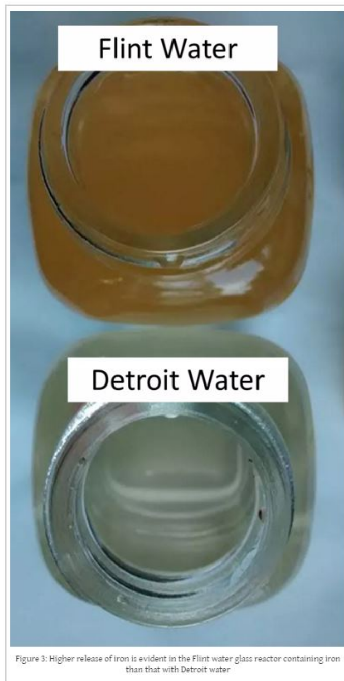
Figure 3: Higher release of iron is evident in the Flint water glass reactor containing iron than that with Detroit water

Flint water that has been in the presence of iron for five days takes on a reddish-orange cast while Detroit water does not. Image is Figure 3 found at http://flintwaterstudy.org/2015/08/why-is-it-possible-that-flint-river-water-cannot-be-treated-to-meet-federal-standards/ by Dr. Marc A. Edwards and Siddhartha Roy.