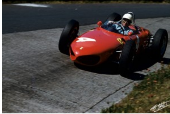
Phil Hill German GP 1961

Phil was my friend, and my mentor. I miss him.