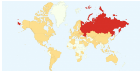
[graphic: Countries with greatest WannaCry infection by 15-MAY-2017]

12-MAY-2017 – ~8:00 a.m. CET – Avast noticed increased activity in WannaCry detections.