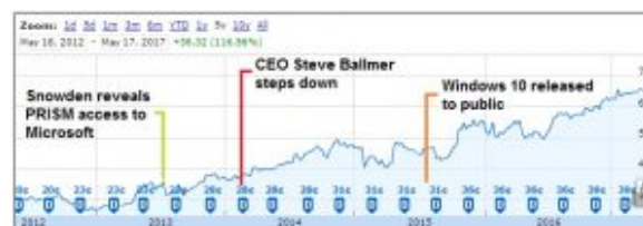
[graphic: 5-year chart, MSFT performance via Google Finance]

While Microsoft complains about the NSA's vulnerability hoarding, they don't have much to complain about. WannaCry will force many users off older unsupported operating systems like XP, Win 7 and 8, and Windows Server 2003 in a way nothing else has done to date.