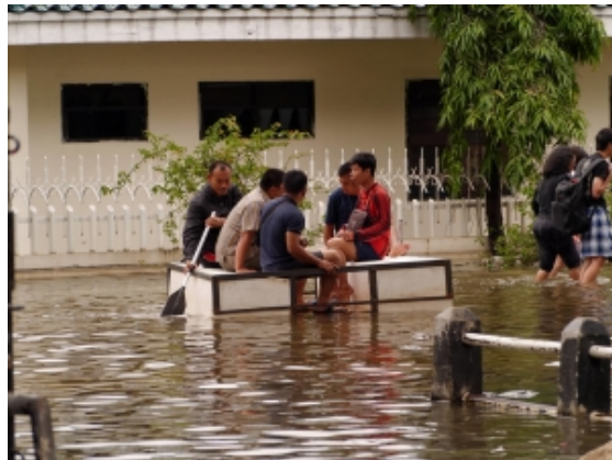
Flooding in Jakarta, 2013.

Californians think its their pioneering right to build houses and whole towns deep into the wildlands, land evolved to burn in a place that has been catching fire on a geologic time scale. But Fire doesn't care where we think we should build our wooded, outdoorsy, and cheap retirement homes.